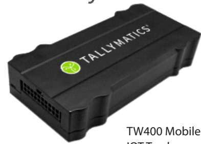
TW400 Mobile IOT Tracker

TruFleet.Cloud is designed to deliver no-compromise, feature rich geo-location tracking to mobile device users AND traditional cellular telematics, over multiple simultaneous vendor networks: Motorola, Tait, Kenwood, ICOM; LTE or LMR. Suitable for small or large fleets, beyond pure location we expand the mission awareness by integrating information from devices such as the Sprite TW400 IoT Tracker, which can access vehicle diagnostic information, and fuel consumption, track driving behaviour and even monitor BLE tagged equipment to ensure your team has the right “kit”, and doesn’t lose it.